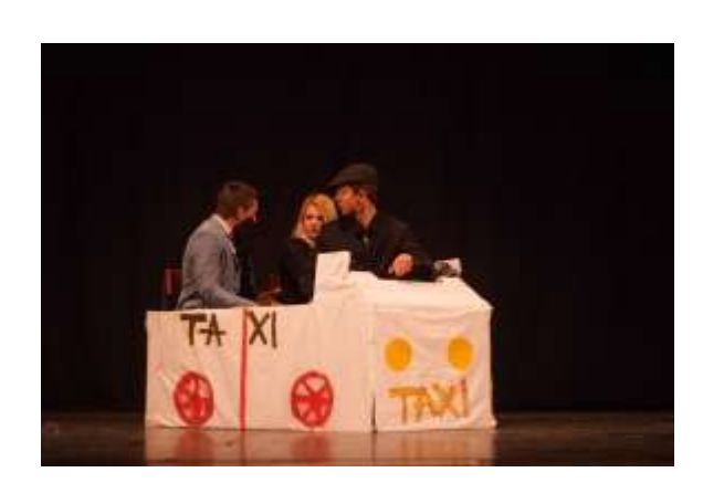
French Theater Contest in Prilep: Two EVS French volunteers took participation as actors