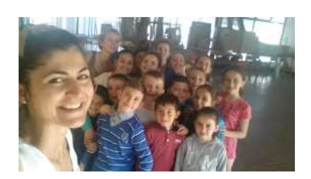
EVS volunteers working with children in schools in Prilep