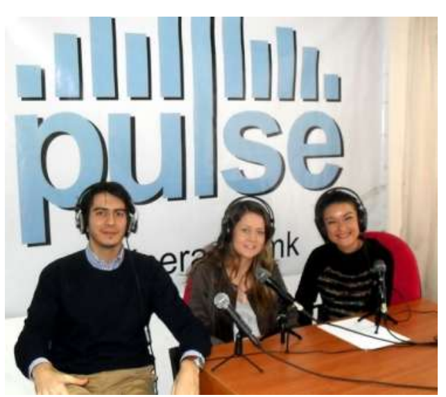
EVS volunteers working in the PULSE Radio